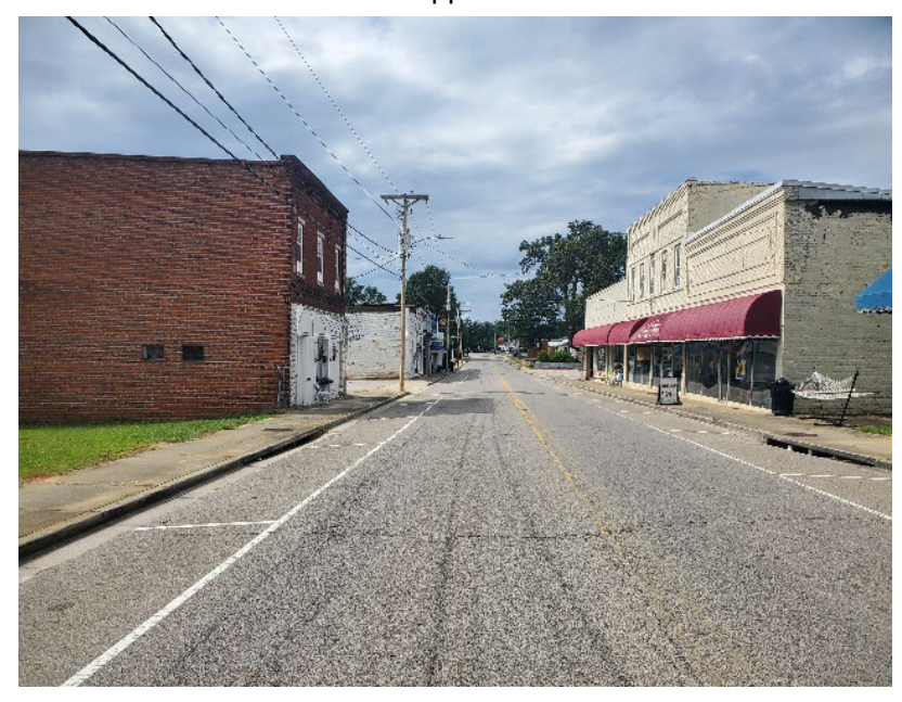
Murals on blank walls, street lights, sidewalk improvements and landscaping would make downtown St. Matthews more inviting

The changing retail landscape and declining population has left some once-thriving commercial areas in the county careworn and idle. Investment in basic street and sidewalk maintenance, landscape improvements, and attractive streetlighting should