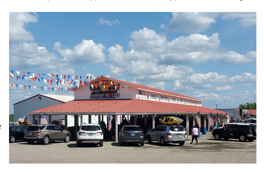
An example of a diversified farm and agribusiness operation with produce market, café and farm tours in Spartanburg County, Cooley Farms and Strawberry Hill on SC Highway 11 near Chesnee.

Working with farmers and agribusiness owners to expand and diversify agriculture production and bring additional agribusinesses to the county builds on one of the county's strengths. Golden Kernel Pecan provides a good example of the benefits of producing finished, ready-to-consume products instead of or in addition to commodity products. The county should encourage more local